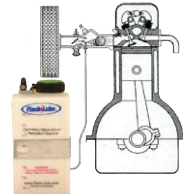
• Flashlube Valve Saver System - Fuel Injected Engine

For maximum performance the inlet port for the Flashlube system should be between the butterfly valve and inlet manifold. 50mm to 100mm away from the butterfly valve towards the inlet manifold should provide good mixing with the air/ fuel stream. Drill and insert the supplied 3.6mm self tapping connector, as described for carburetor engines.